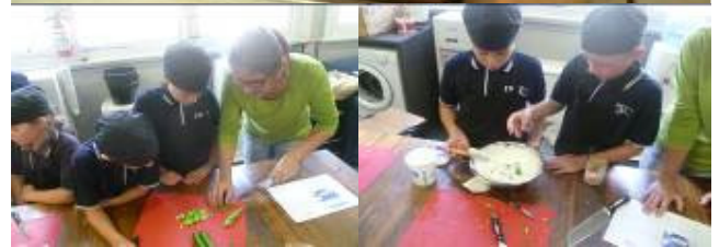
Tzatziki with Flat Bread