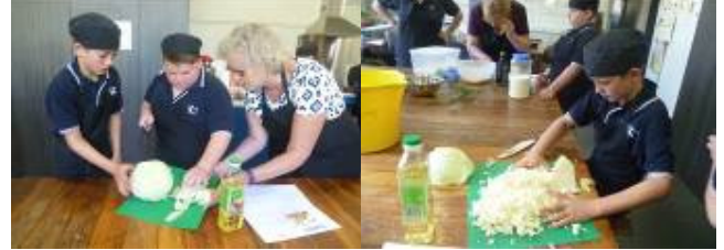
Beef & Noodle Chow Mein