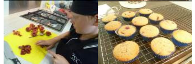
Plum & Hazelnut Cakes